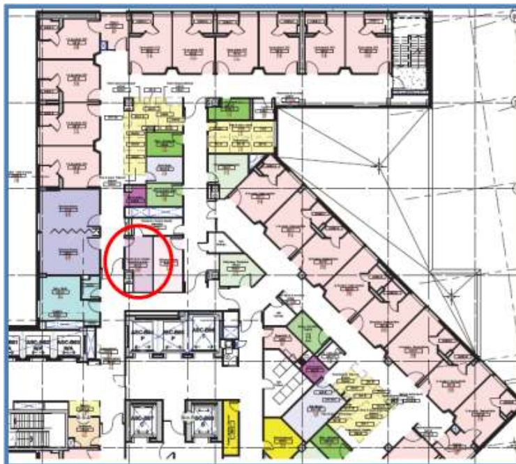
Plan of 8th floor medical/surgical unit showing location of playroom

"Kurling for Kids" Playroom on the Medical/Surgical Ward - Location: 8 th Floor, Pavillion B, Size: 14.29 m 2 (154 ft 2 )